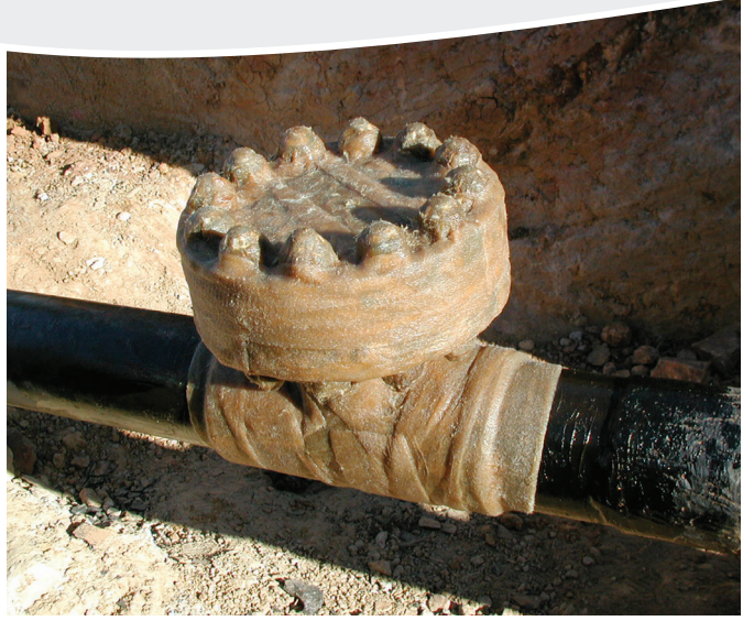
Trenton's Wax-Tape® #1 non-firming anticorrosion wrap protects irregularly shaped underground fittings and is compatible with cathodic protection.

Wax-Tape® #1 anticorrosion wrap is composed of a blend of microcrystalline waxes, plasticizers and corrosion inhibitors saturated into a non-woven, non-stitch bonded synthetic fabric. Wax-Tape #1 wrap also contain no siliceous mineral fillers.