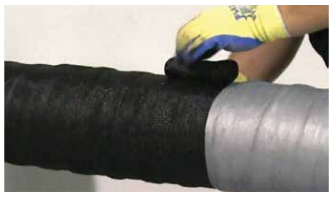
For some exposed applications, or applications requiring additional mechanical protection, Trenton recommends the use of an outerwrap. Trenton MCO* 110 moisture-cured outerwrap (shown above) provides excellent mechanical strength and quick curing times.