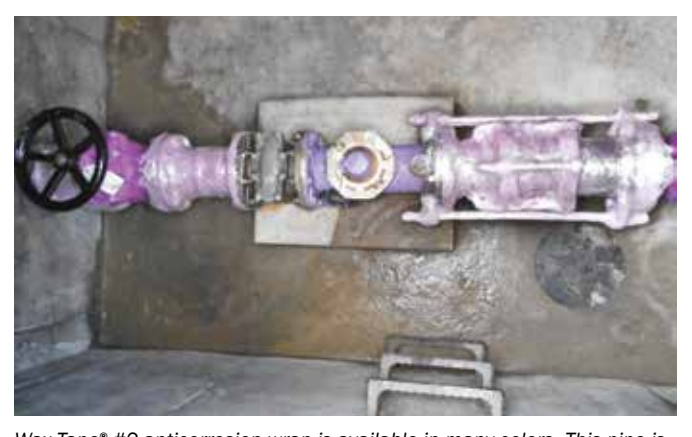
Wax-Tape® #2 anticorrosion wrap is available in many colors. This pipe is wrapped in purple tape, often used in the water industry.

*Also available in purple, yellow, red, blue and green